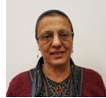
(✉ Corresponding Author)